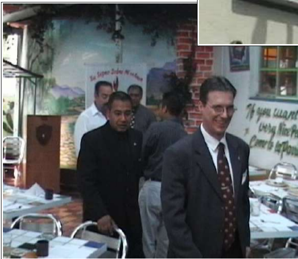
Chapter „La Parrilla“