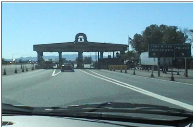
Gate to California