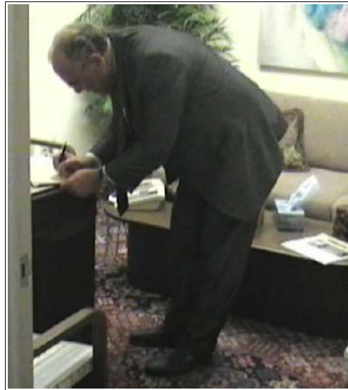
Sign in - Guestbook

The brethren in the latino-american chapter "La Parrilla", have us received very heartily and saying, if we come back to Germany we should say to the brethren, they have a family on the other side on the world, where they every time are welcome.